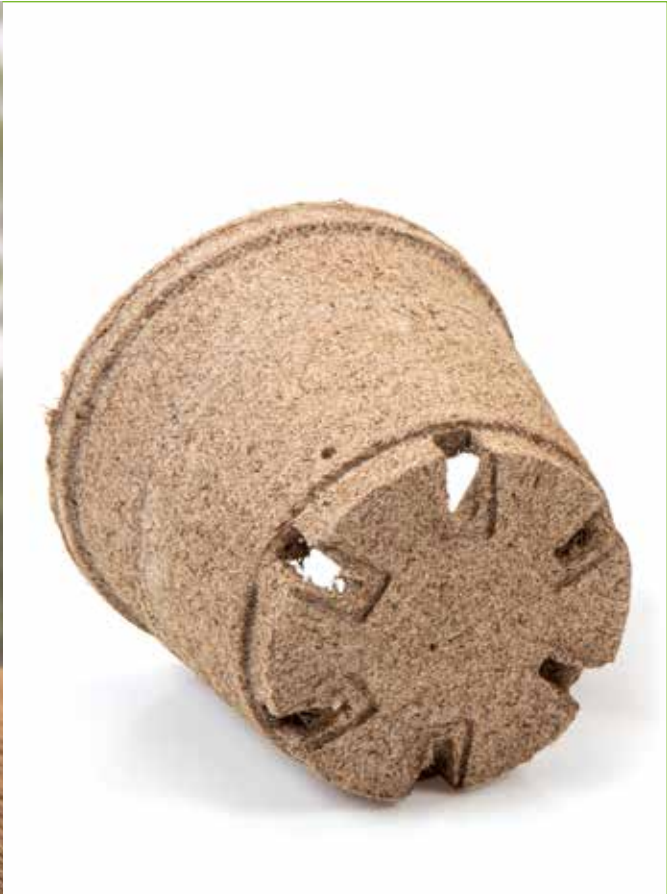
Jiffy Pot, R2