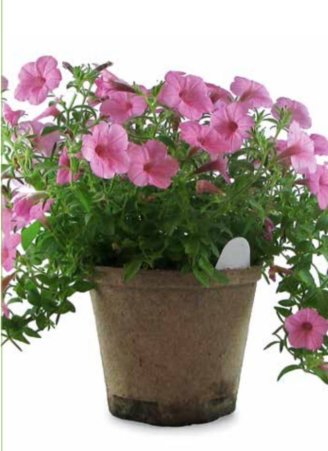
Jiffy Pot, The original