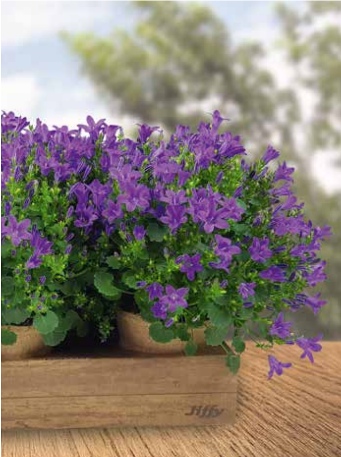
Jiffy Pot, R2