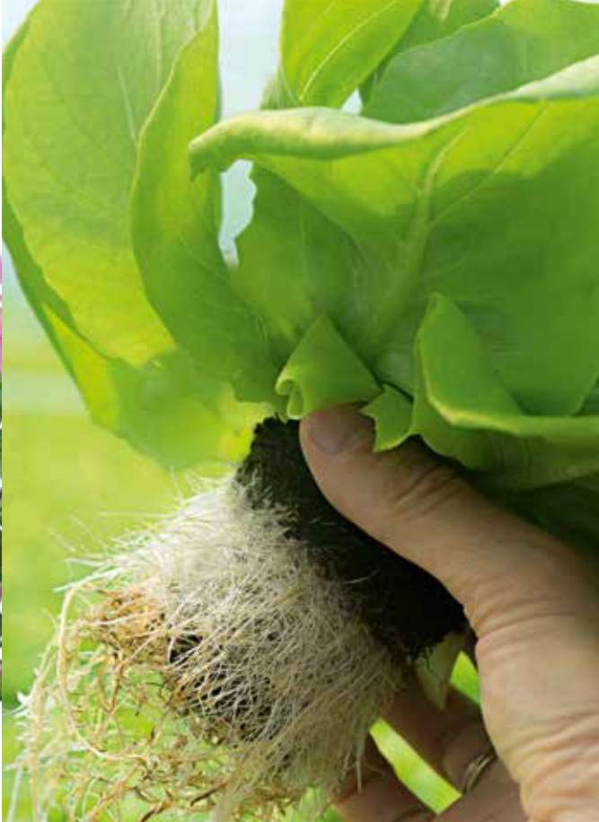
Jiffy Pot, The original