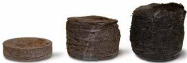
Jiffy-7 pellet in 3 steps